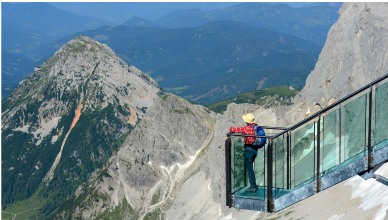
© Der Dachstein - Gery Wolf