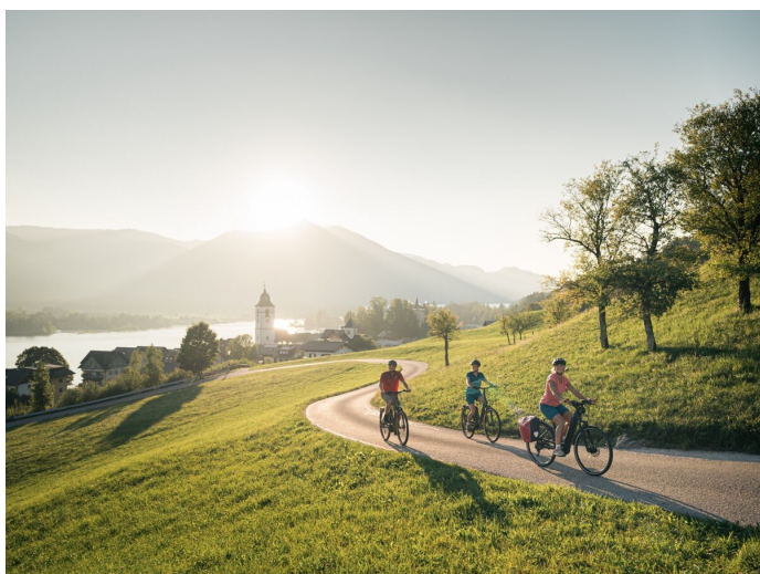
© Oberoesterreich Tourismus Wolfgangsee Moritz Ablinger